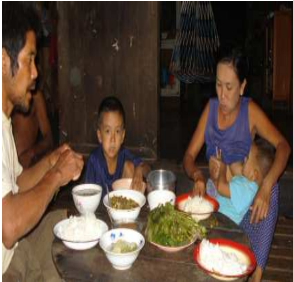
A family also distribute their option on farming

a little with some rice after rotational farming's implementation. However, it wasn't much enough but better than previous situation, like "Something is better than nothing" in Mon tribe saying. Although people at past much concerned their livestock on rotation farming, they at the movement not much on it, and changed their living a little not only on paddy field, but also rubber, betenebt and lemon. Although farmers on daily life were hard-working, the food from farm rotation provided a little enough for them. Their life was under poor situation.