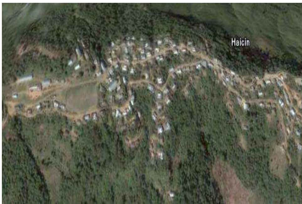
Figure 3- Chin research site in western part of Burma