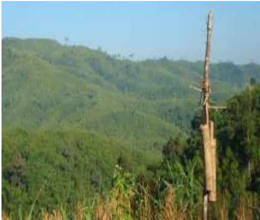
F-3: Symbol for hinting all birds and wild animals