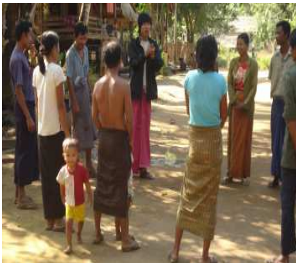
F1: during playing "introducing name" game

(2) In Mon research side, researcher carry out the usage of research analysis, individual and communal interviewing, group discussion and playing game and visiting to farming for research's success. With above methodology, the researcher directly collected data of rotational farming, supported advocacy for indigenous knowledge issue and revised the current challenge/ problem of shifting cultivation.