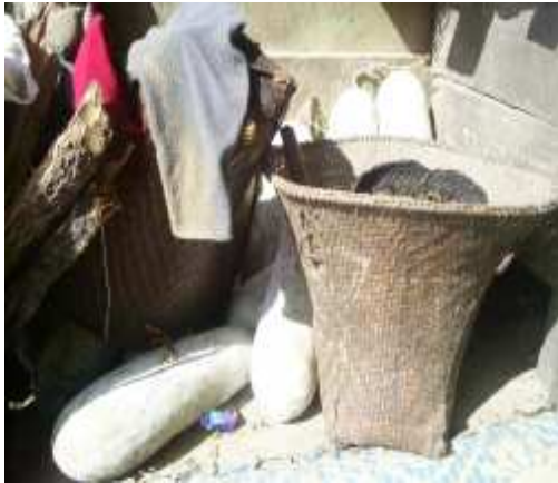
F-4: Farming materials