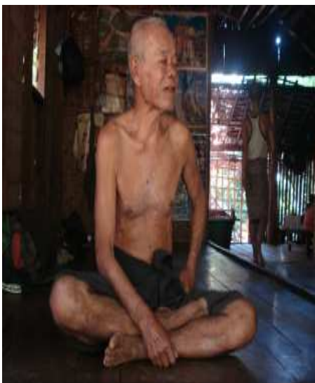
F- 1: A old man share his farming experience

Chin researcher documented that in Chin state, the ruling government and NGO had frequently urged with local farmers to transform alternative livelihood techniques instead of practicing ancient rotational farming which definitely impacts against on natural environment. Before 2000, government had also enforced unclear new policy that may withdraw the old system of rotational farming, and forced all local farmers to cultivate tea plantation. The new methodology had already examined with tea and castor oil plantation and cotton by in creation a new method of ladder plantation in 2002, but it couldn’t bring a success except rice product’s failing. In accordance with ruling military forestry, chin indigenous