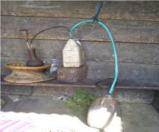
F-1: Tool for cooking traditional alcohol