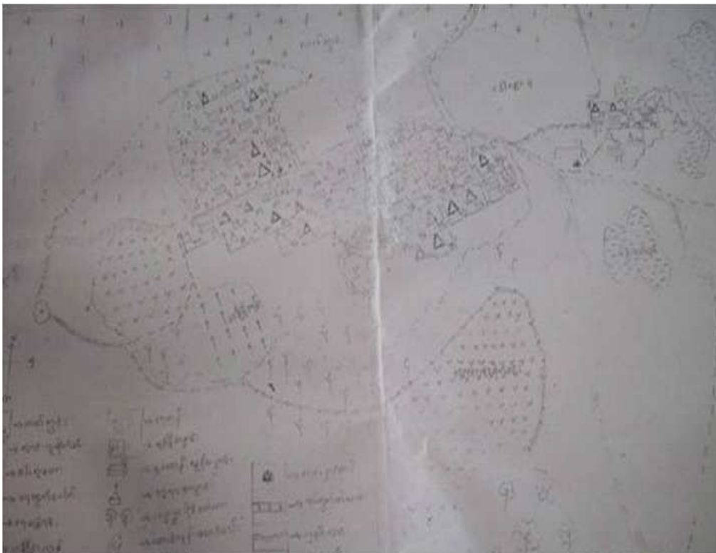
Figure 1- Map of Karenni research site, northern east of Burma