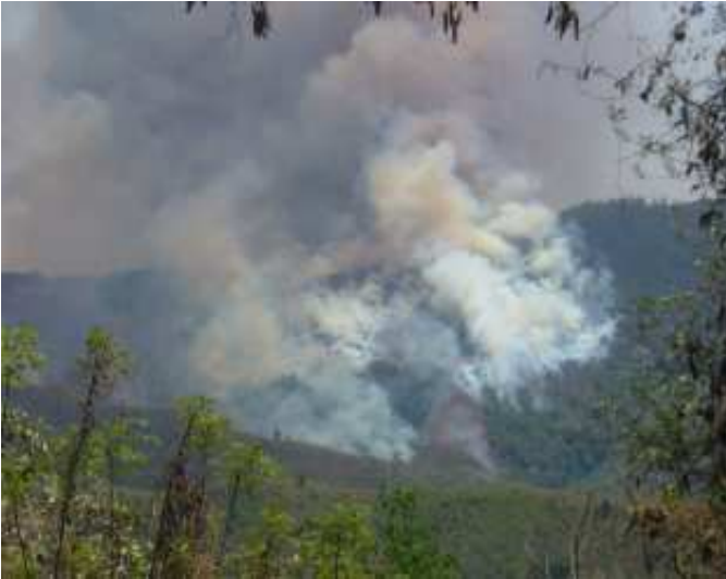
A view of fire burning on farm in Chin state, Burma

rotation less concerned on global warming because it already took place since none development of technology, and caused a lot problem. After development, factory, kinds of cars and supermarkets were popular daily factor which create high smoke to pollute clean air in environment, and affect the layer of ozone by such terrible acid. The smokes from farm burning don't cause much pollution through acid to environment. The forest and mountain regenerate by it after a year even if many old plots