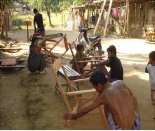
F- 2: Traditional chair methodology