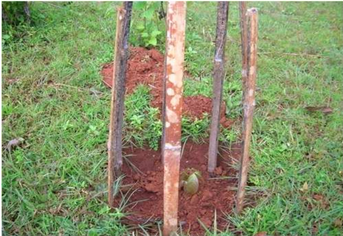
F-5: long-term castor oil plantation by military regime