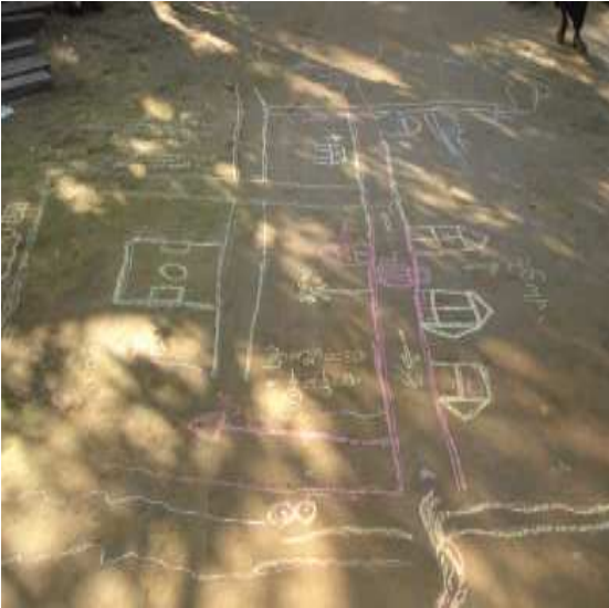
F2: drown-picture by indigenous villagers

Then set up a circle that 16 villagers could see face to face and he explained an instruction to play it. And told them the objectives of playing this game is building a relationship and knowing each other. Firstly, a person held a ball and then called the name of another person to throw a ball. Later on, he let them draw a picture of their village including all things, and advised through staying behind to draw a simple picture that every people can see clearly . He also said them not to forget to include their environment landscape. One of male participant said that they couldn't forget the view of our village because they saw it every day, and they had never familiar this